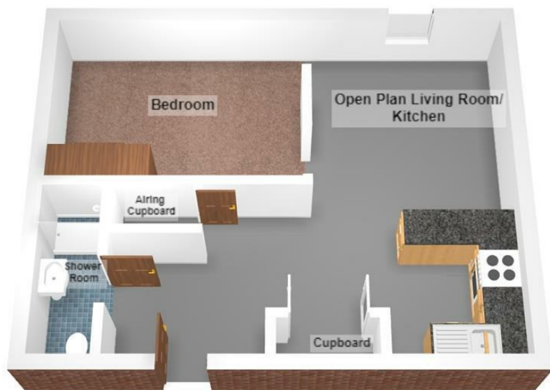
Fleet House, Leicester

All measurements are approximate and for display purposes only